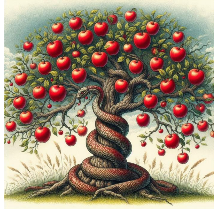
AI-generated image created with Microsoft Copilot